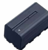
2x Li-Ion rechargeable battery 7.2 V 2.2 Ah